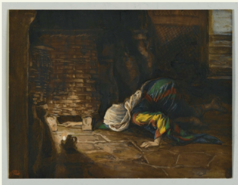
The Lost Drachma (La drachme perdue) by James Tissot